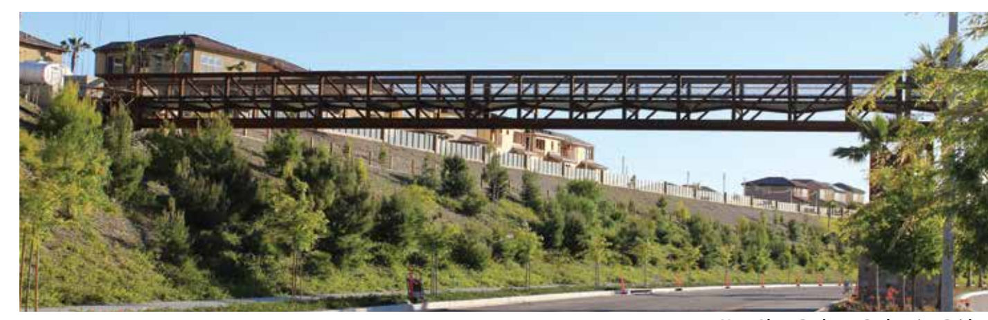
New Alton Parkway Pedestrian Bridge

Portola Center, located near the existing Portola Hills neighborhood, is currently in grading stages, with "The Oaks" model homes in construction in the Northwest Planning Area of the subdivision. Once completed, Portola Center will feature up to 930 homes, a 5-acre community park, various neighborhood parks, and a mixed-use site.